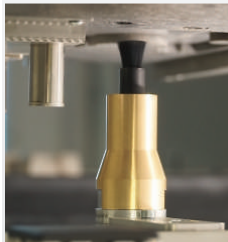
automatic brush system integrated in the process area

Further options on request. ● Standard ○ Option