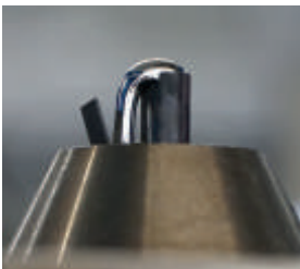
innovative solder nozzle technology

Alternatively, there are two different solder nozzle types available. Non-wetted solder nozzles are nearly maintenance-free and they are featured with an almost unlimited lifetime. Wetted solder nozzles stand out due to the possibility that even extremely small pitches can be processed without any difficulties.